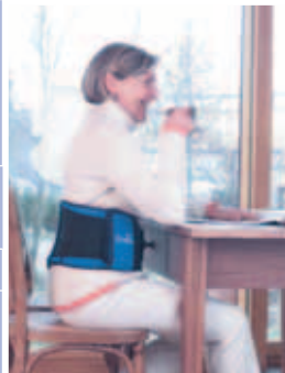
BAXOLVE™ as a stand alone Lumbar Support belt