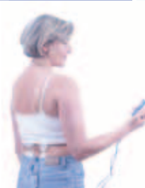
Use of TENS without Lumbar Support